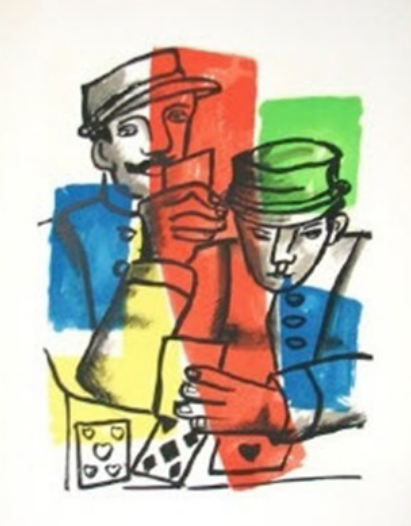
Exhibit: June 14-August 5