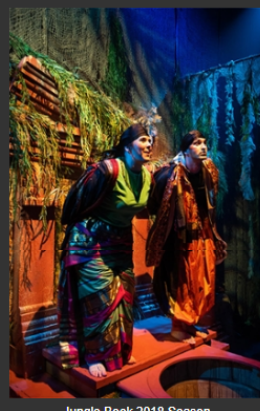
Jungle Book 2018 Season