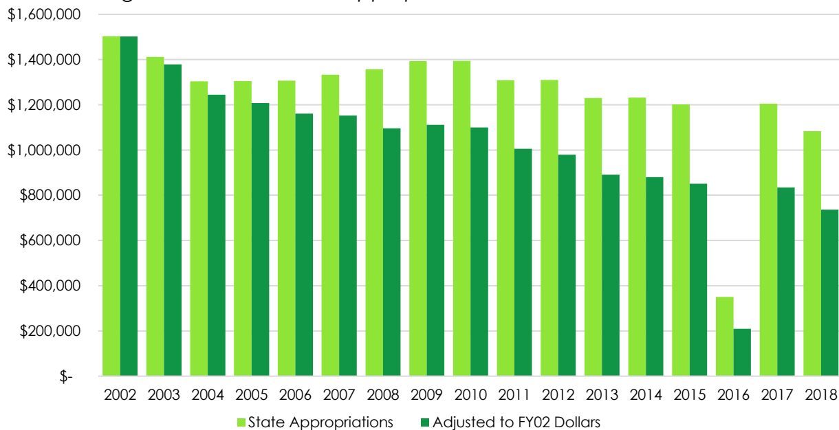
Figure 1: Historical State Appropriations for Illinois Public Universities

In Fiscal Year 2002 state appropriations accounted for 72% of total university revenue. The remaining 28% was derived from University Income Funds (UIF), which are primarily tuition and fees. By Fiscal Year 2010 the relationship between state appropriations and UIF had reached parity, with 49% general revenue and 51% UIF. Therefore, Fiscal Year 2010 will be used as the point of comparison for much of the analysis that follows. Also of note, the state appropriations in Fiscal Year 2016 budget was only 30% of what it was in Fiscal Year 2015 and only accounted for 15% of total revenue. The second issue of note is that university appropriations for Fiscal Year 2018 were cut 10% relative to Fiscal Year 2017.